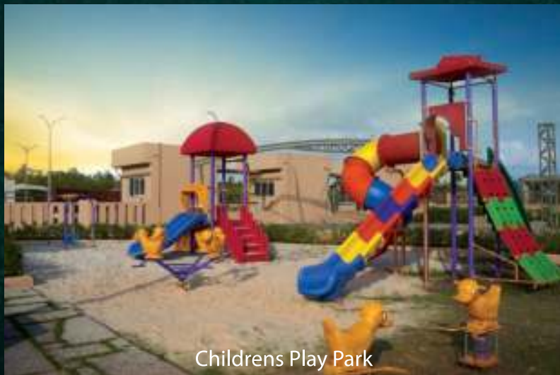
Childrens Play Park