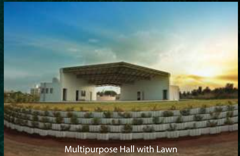
Multipurpose Hall with Lawn