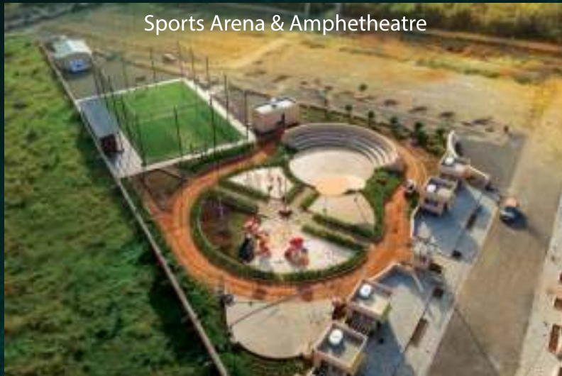
Sports Arena & Amphetheatre